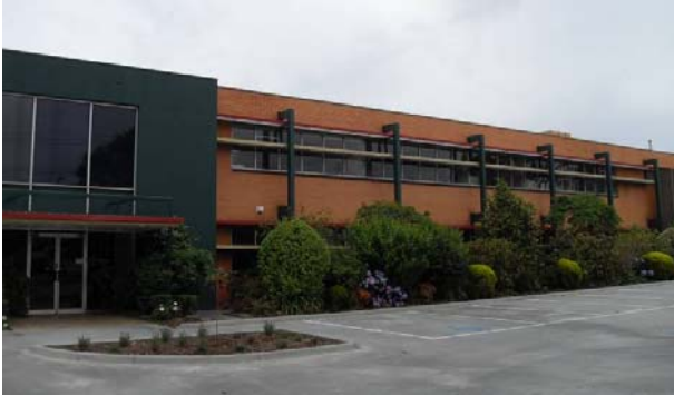
FGB Head Office, Oakleigh South

FGB Natural Products (FGB) is an independent Australian owned and operated pharmaceutical company specialising in natural products.